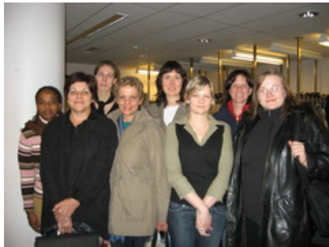
EAMT staff and the team

The visit to EAMT included a tour of the campus. Then we had a short overview of the EAMT Library and the walk in the library. We then discussed the library activities with the library specialists and more about the functionalities they use within the system.