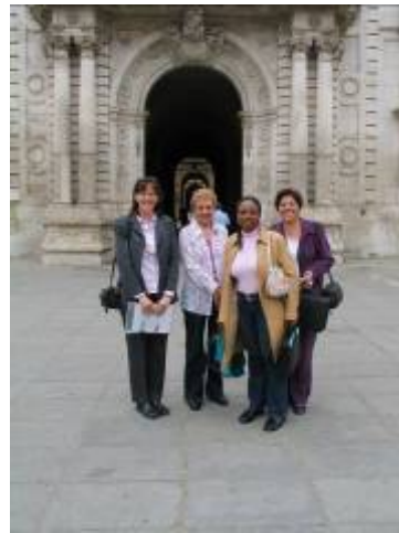
The Project Team

The Pablo de Olavide University Library is quite small. Click on the link for more information about this library. http://www.upo.es/ingles/investigacion/biblioteca/index_biblioteca.html