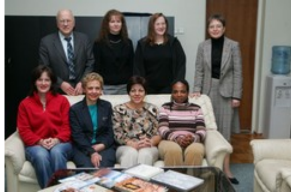
National Library staff and the project team

We joined the staff from the Estonian Academy of Music and Theatre (EAMT) at 13:00 for lunch at the Academy.