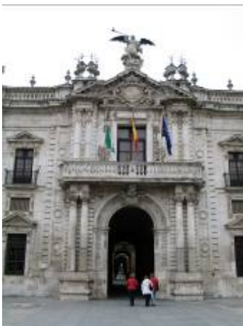
The University of Sevilla