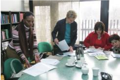
The project team - hard at work!

A meeting with the National Library was scheduled for 10:00-12:30 where we discussed the shared system as an option. The support structures, training etc. and other issues such as the National library's e-library strategy, digitising activities and the library portal.